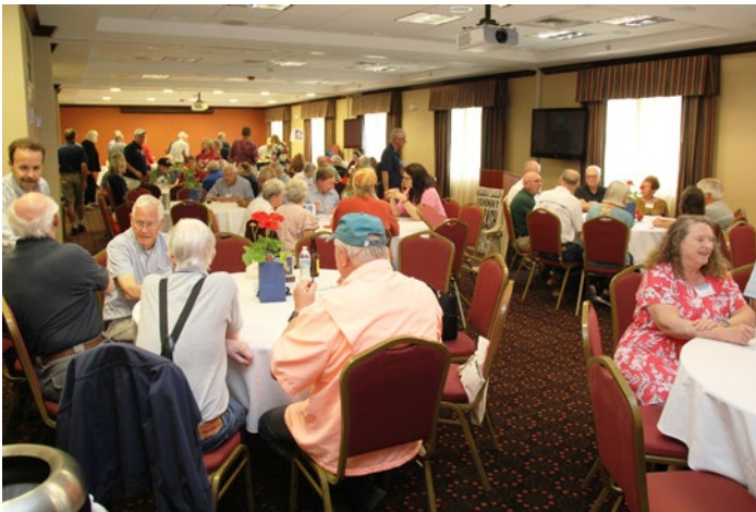
The Sunday meeting hall and dining area.