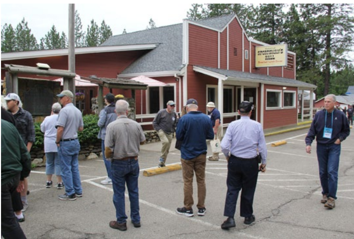
Stop at Sportsman's Hall – Way and Pony Express Station