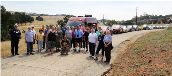
The Drive Tour West on the 1913 Central Valley Route Here we are on Old Bass Lake Road.