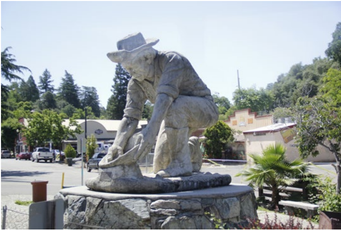
We pressed on through the town of Auburn –