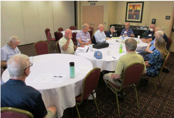
DAY FOUR, June 14, Wed., Meeting, Seminars & Banquet The Annual Election/Board Meeting was held in the morning with the state directors. Very productive with positive accomplishments.