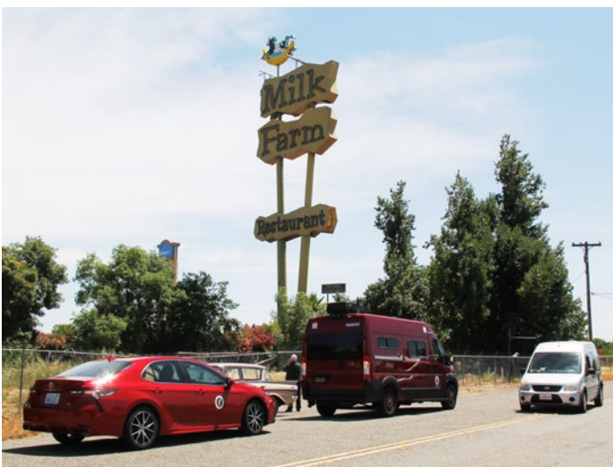
We stopped at the Milk Farm sign in Dixon.