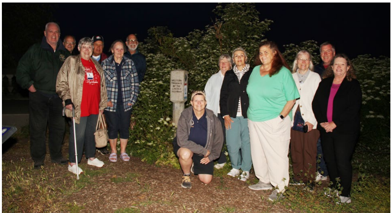
We gathered for a final group photo at the Western Terminus 9 p.m.