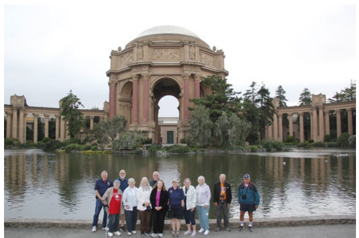
Our group at the Palace of Fine Arts, San Francisco.