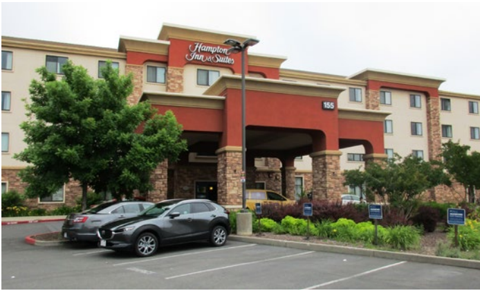
On to our Host Hotel, the Hampton Inn.