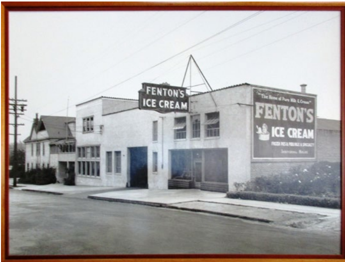
Fenton's Ice Cream – Then.