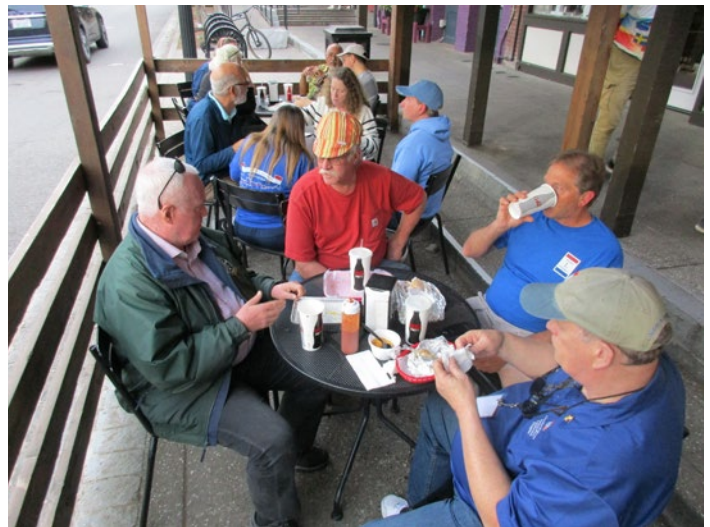
After the tour we patronized the Folsom City Mayor's restaurant – the Sutter Street Taqueria.