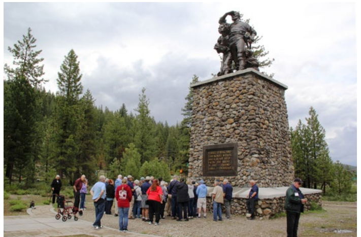
Pioneer Monument, Donner Memorial State Park