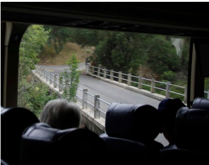
Tight route on Forni Road crossing 1914 Weber Creek Bridge.