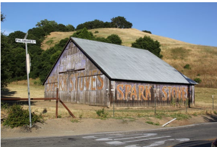
Stop at the last rural barn on the Western Route.