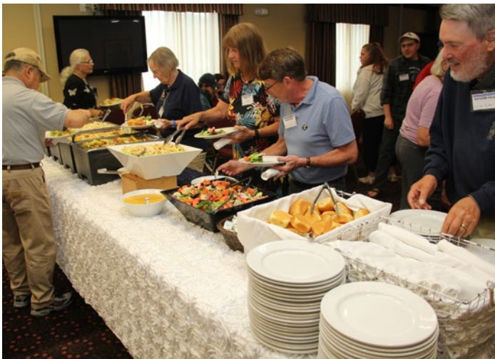
Lots of food was on hand to keep us all full!