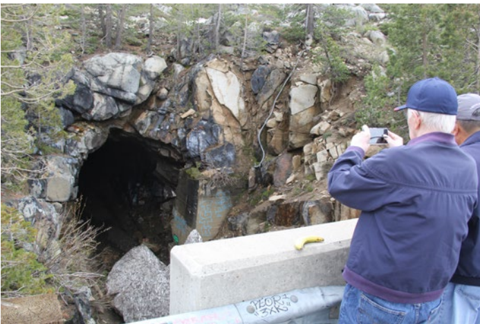
We arrived at Donner Summit and walked out to the historic railroad tunnel from years past.

Due to the road being closed, the plan was for the group to walk to the Rainbow Bridge for a photo opportunity that the California Conference Committee had planned for. Then came the threat of rain.