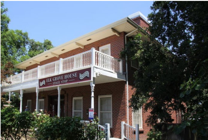
We stopped at the Elk Grove House.