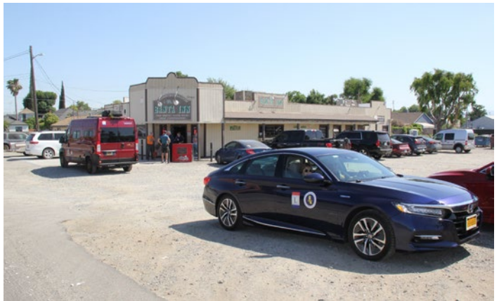
At the Banta Inn.