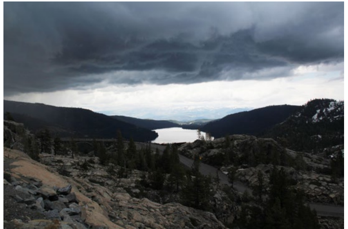
The spectacular view looking down at Donner Lake and the Rainbow Bridge just moments before the clouds let loose.

Due to the road being closed, the plan was for the group to walk to the Rainbow Bridge for a photo opportunity that the California Conference Committee had planned for. Then came the threat of rain.