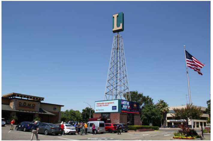
We stopped at the Lincoln Shopping Center.