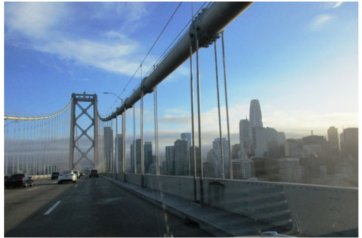
Approaching San Francisco.