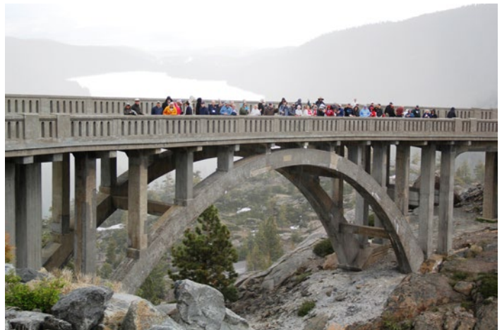
While the group gathered on the bridge, I, the photographer, scrambled to set up the camera on a tripod, while the group got wet, for a long distance shot as the rains started to pour down.