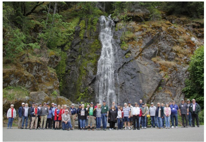
Another stop at Bridal Veil Falls.

Bus Tour on the 1913 Sierra Nevada Southern Route LH Alignment via Echo Summit, South Lake Tahoe to Cave Rock.