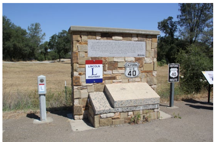
Then we stopped at the Ophir Road LH Monument.