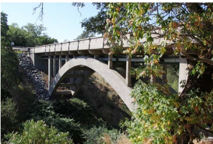
Our first stop was at the recently rebuilt Cold Creek Bridge.