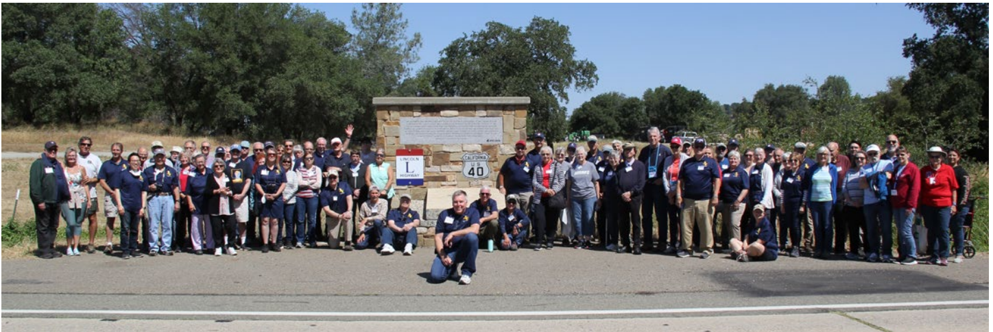
DAY THREE, June 13, Wednesday Bus Tour 2 Bus Tour 2 took the group on the Northern Sierra Nevada Alignment over Donner Pass. Group photo at Ophir Road Monument.