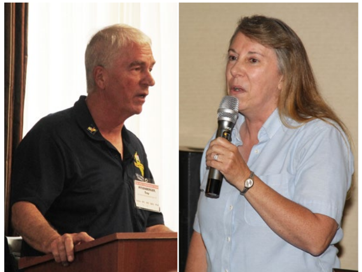
After some introductions and thank yous from our Lincoln Highway Association leaders and Folsom government officials...