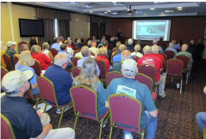
Five presentations filled a packed room with very interesting content, all revolving around the California Lincoln Highway alignments and history thereof.