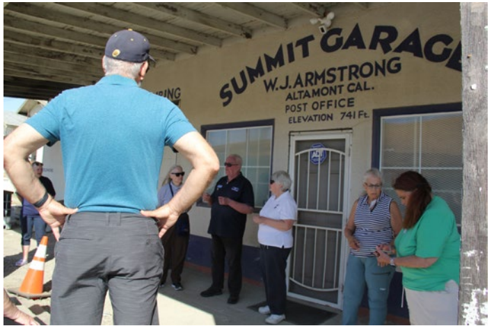
And a stop at the Summit Garage.