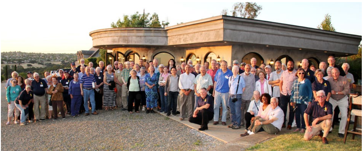
Group photo at Banquet Dinner