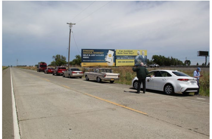
We stopped again on some of the original 'Highway 40' concrete section, just west of the Yolo Causeway.