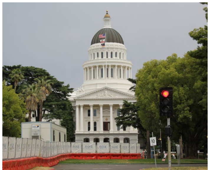
A little drive further, after passing the State Capital we arrived at Folsom...