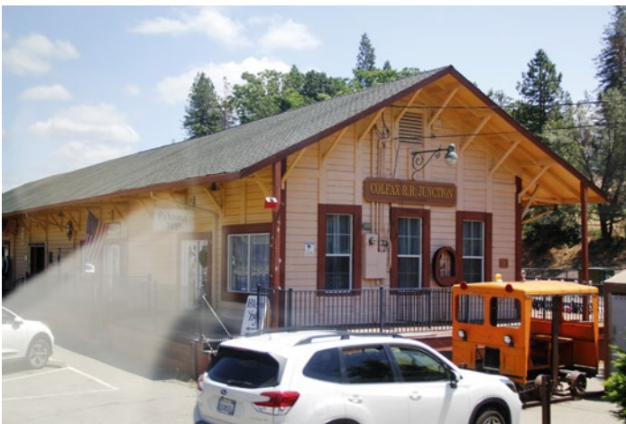
and then through the town of Colfax.