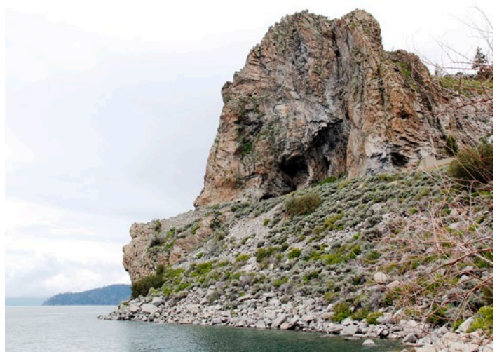
Our final stop – Cave Rock, Nevada.