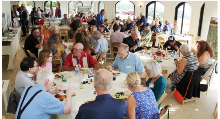
Our outstanding banquet dining and awards room.