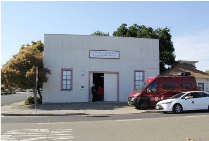
Stop at the Duarte Garage.