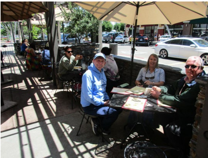
We lunched at the historic Fenton's Ice Cream Factory, now a Parlor and Eatery.