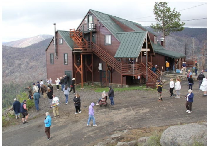
This was our lunch stop at Echo Summit.